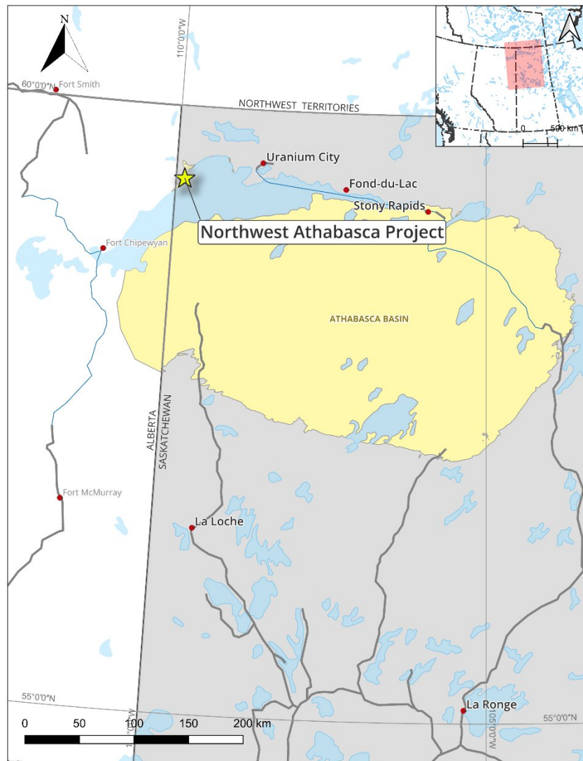
Figure 1 Location of the Northwest Athabasca Project along Lake Athabasca in northwestern Saskatchewan. The closest communities are Uranium City, Fond du Lac and Fort Chipewyan. The western margin of the property is located along the Alberta – Saskatchewan Border.